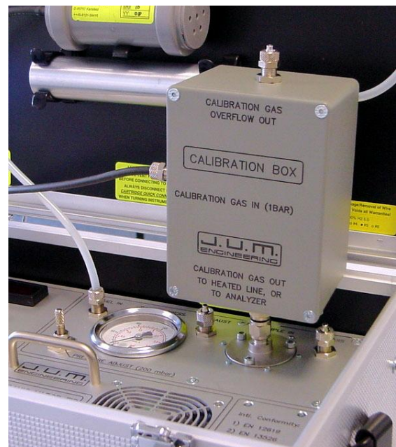
Sample Inlet shown with optional ECB 3000 Calibration Box

J.U.M.® Engineering G.m.b.H. Manufacturing, R&D, Distribution & Service Gauss-Str. 5 D-85757 Karlsfeld, Germany Tel.: 49-(0)8131-50416, Fax: 49-(0)8131-98894 E-mail: info@jum.com, Internet: http://www.jum.com